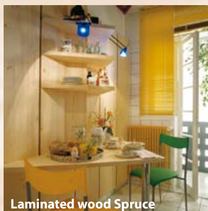
Laminated wood Spruce

Both in house production as well as merchandised goods are distributed. More than 40 profiles are constantly available in 13,00 m lengths.