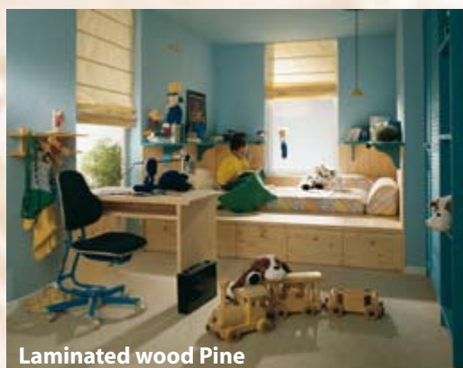
Laminated wood Pine