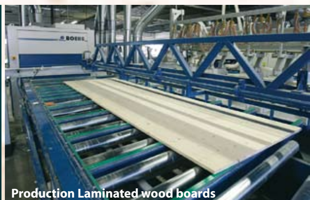
Production Laminated wood boards